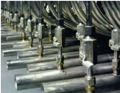
HOSCO supply and return ball valves for robotic facia painting system.