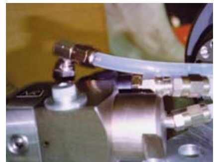
HOSCO fittings, hose and connections for automatic applicators.