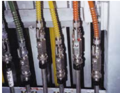
Typical Hosco paint circulating station for multiple colors.