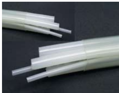
HOSCO custom bundled paint hose for automatic systems.