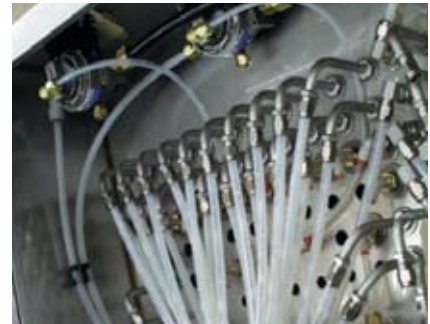
HOSCO stainless steel sweep bulkhead fittings for robotic cat-track system.