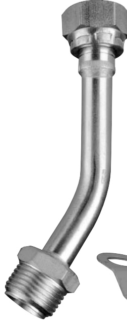
GE - 630