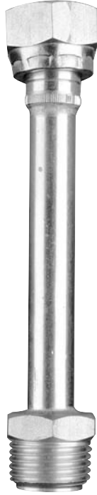
GE - 600